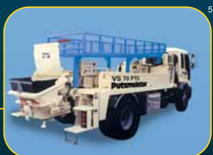
VS Series • Vehicle Mounted