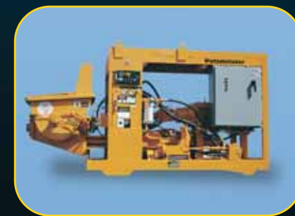
TKS Series • Skid-Mounted

Available in diesel or electric skid-mounted versions. Contact factory.