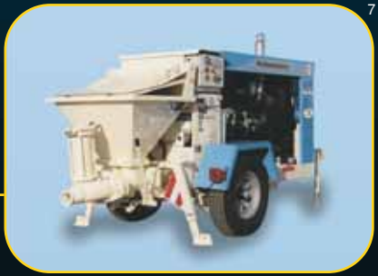
TKB Series Hydraulic Ball Valve Pumps

Available in diesel or electric skid-mounted versions. Contact factory.