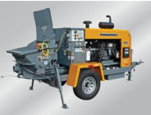
Thom-Katt Series — Tier 3