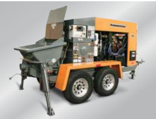
Thom-Katt Series — Tier 4 Final